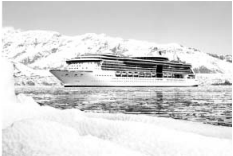
Radiance of the Seas at Hubbard Glacier

The weather was perfect—sunny, shirt-sleeve days. It didn't even rain in Ketchikan which has over 200 days of rain per year. All-in-all an unforgettable trip of a lifetime.