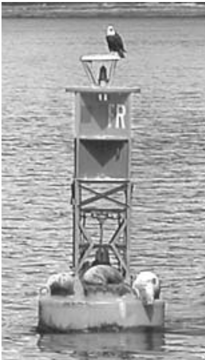
SeaLions, Eagle on Bouy