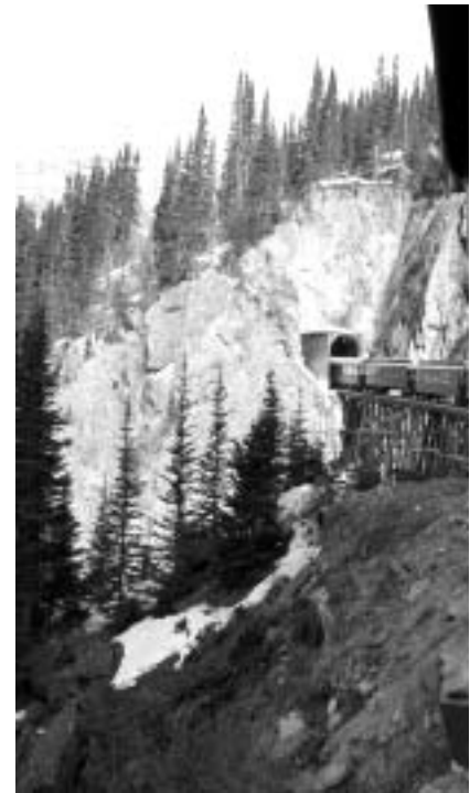
Scene from White Pass Railroad