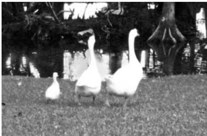
A stroll with father on Father's Day