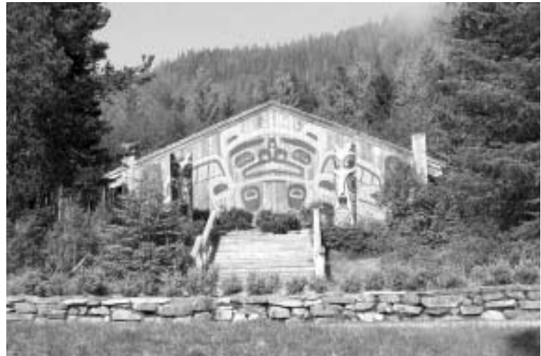
Clan house at Saxman Native Totem Village, Ketchikan