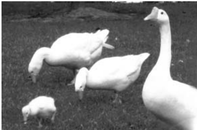
Taking a bit of nourishment